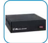
Base Station Power Supply 110V/220V AC (MS-0730)