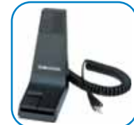
Base Station Microphone (ACC-702)