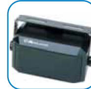
Heavy Duty Remote Speaker (AA-1470A)