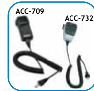
Heavy Duty DTMF Mobile Mic (ACC-709) Heavy Duty Mobile Mic (ACC-732)